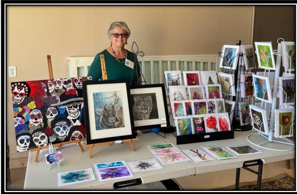
ART PATHS DECEMBER 2024