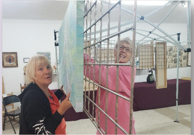
Setting up the Art pieces