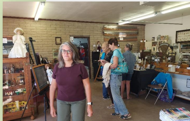
Attendees enjoying the art show