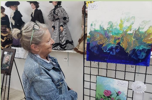
Attendee looking at beautiful art.